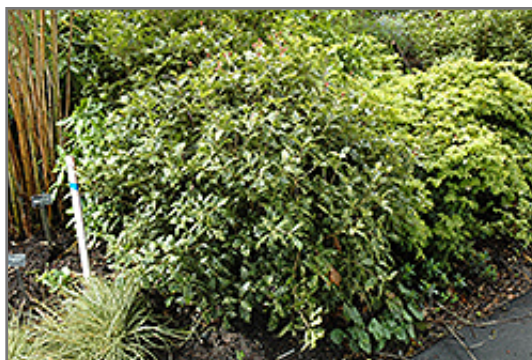
Variegated False Holly

Variegated False Holly is recommended for the following landscape applications;