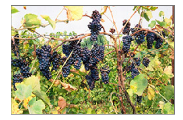
Pinot Noir Grape fruit