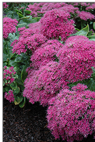
Neon Stonecrop flowers

Neon Stonecrop is a dense herbaceous perennial with an upright spreading habit of growth. Its relatively coarse texture can be used to stand it apart from other garden plants with finer foliage.