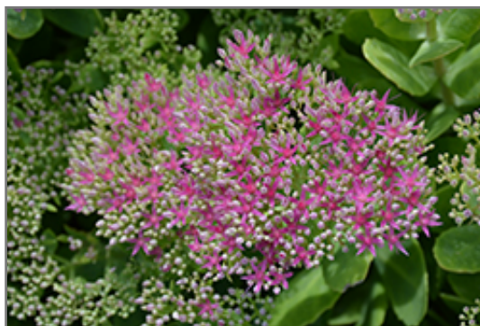
Neon Stonecrop flower buds