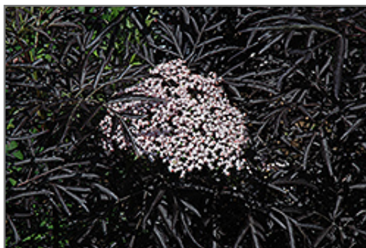
Black Lace Elder flowers

Black Lace Elder is a multi-stemmed deciduous shrub with an upright spreading habit of growth. It lends an extremely fine and delicate texture to the landscape composition which can make it a great accent feature on this basis alone.