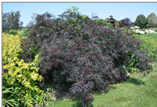
Black Lace Elder