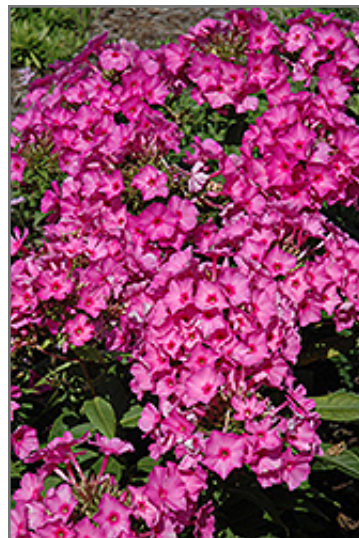
Flame Pink Garden Phlox flowers

Flame Pink Garden Phlox is recommended for the following landscape applications;