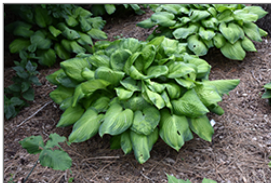
Guacamole Hosta