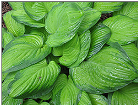
Guacamole Hosta foliage

Guacamole Hosta is a dense herbaceous perennial with tall flower stalks held atop a low mound of foliage. Its relatively coarse texture can be used to stand it apart from other garden plants with finer foliage.