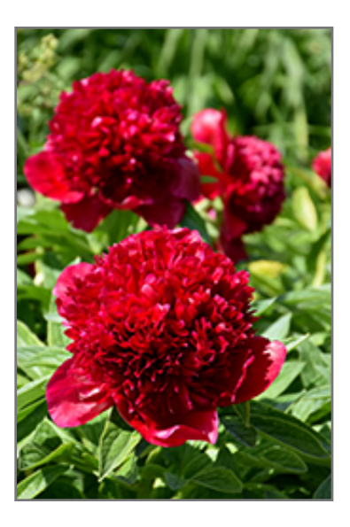
Red Charm Peony flowers