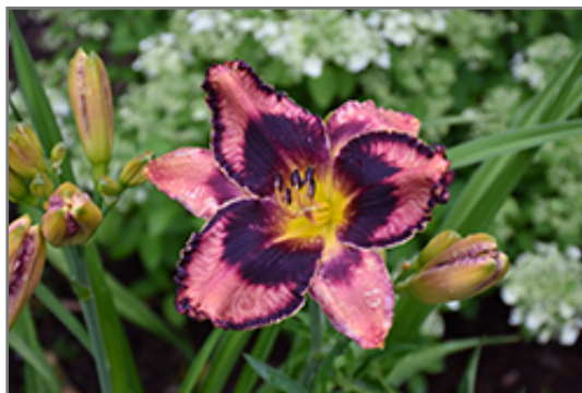
Rainbow Rhythm Storm Shelter Daylily flowers