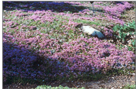
Mother-of-Thyme in bloom