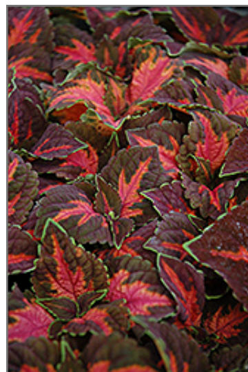
Superfine Rainbow Festive Dance Coleus foliage

Superfine Rainbow Festive Dance Coleus is recommended for the following landscape applications;