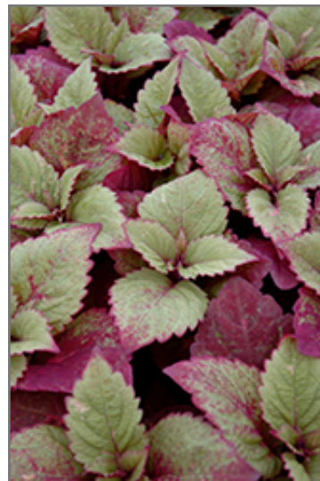
ColorBlaze Royal Glissade Coleus foliage