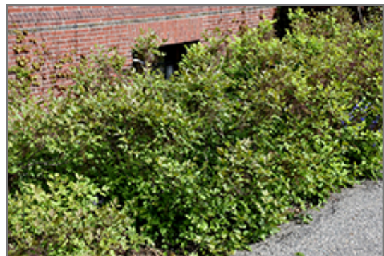
Shrub Yellowroot