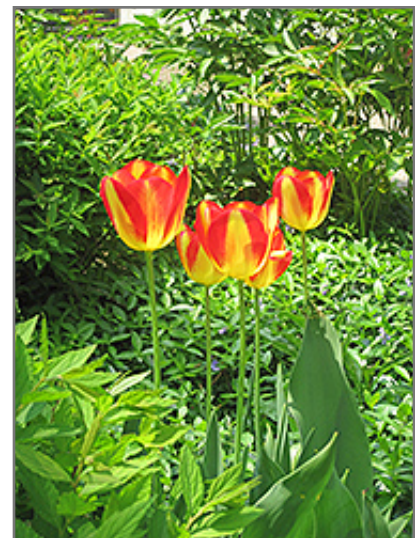
Antoinette Tulip in bloom