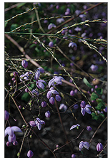
Splendide Meadow Rue flowers