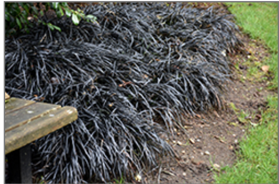
Black Mondo Grass

Black Mondo Grass is recommended for the following landscape applications;