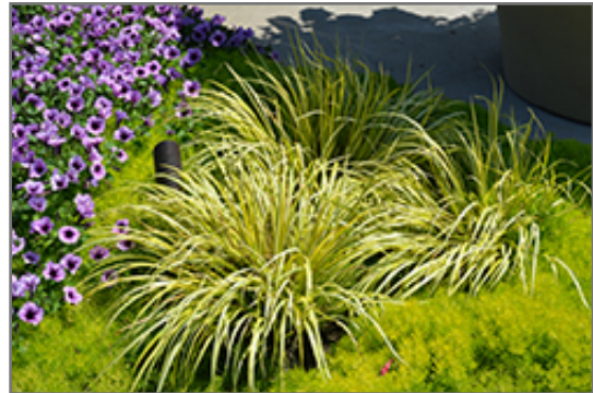
Grassy-Leaved Sweet Flag

Grassy-Leaved Sweet Flag is recommended for the following landscape applications;