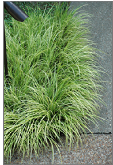
Grassy-Leaved Sweet Flag

Grassy-Leaved Sweet Flag is a fine choice for the garden, but it is also a good selection for planting in outdoor pots and containers. It is often used as a 'filler' in the 'spiller-thriller-filler' container combination, providing a canvas of foliage against which the larger thriller plants stand out. Note that when growing plants in outdoor containers and baskets, they may require more frequent waterings than they would in the yard or garden.