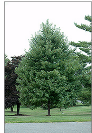
October Glory Red Maple