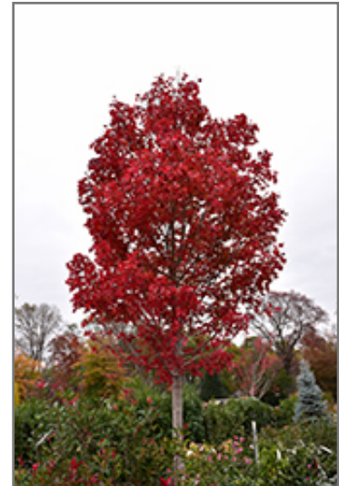
October Glory Red Maple in fall