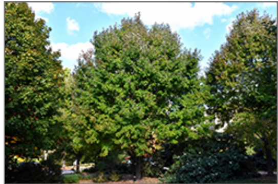
Autumn Flame Red Maple

This tree should only be grown in full sunlight. It is quite adaptable, preferring to grow in average to wet conditions, and will even tolerate some standing water. It is not particular as to soil type, but has a definite preference for acidic soils, and is subject to chlorosis (yellowing) of the foliage in alkaline soils. It is somewhat tolerant of urban pollution. This is a selection of a native North American species.