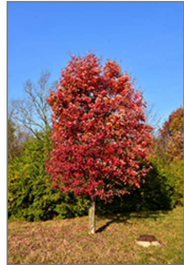
Autumn Flame Red Maple in fall

Autumn Flame Red Maple is recommended for the following landscape applications;