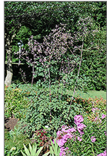
Rochebrun Meadow Rue in bloom