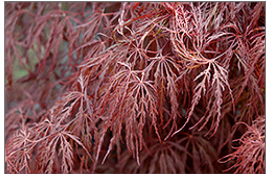
Crimson Queen Japanese Maple foliage

Crimson Queen Japanese Maple is recommended for the following landscape applications;