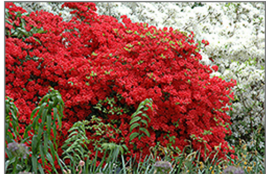
Stewartstonian Azalea in bloom

Stewartstonian Azalea is recommended for the following landscape applications;