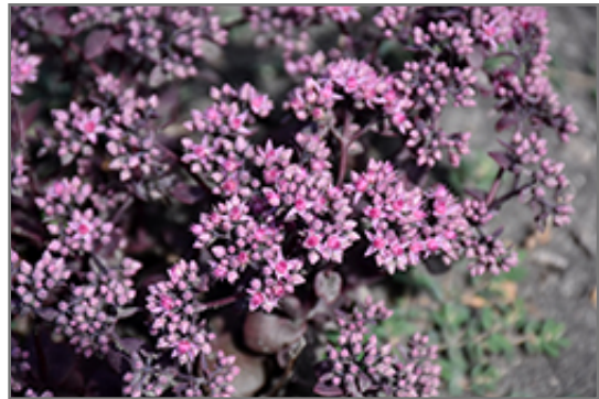
Red Carpet Stonecrop flowers