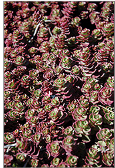
Red Carpet Stonecrop foliage

Red Carpet Stonecrop is a dense herbaceous perennial with a ground-hugging habit of growth. It brings an extremely fine and delicate texture to the garden composition and should be used to full effect.