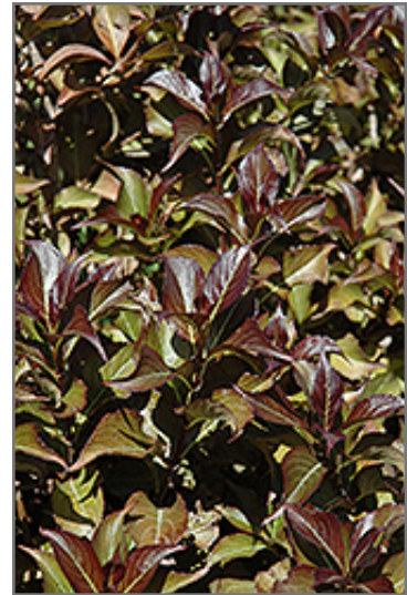
Dark Horse Weigela foliage

Dark Horse Weigela makes a fine choice for the outdoor landscape, but it is also well-suited for use in outdoor pots and containers. Because of its height, it is often used as a 'thriller' in the 'spiller-thriller-filler' container combination; plant it near the center of the pot, surrounded by smaller plants and those that spill over the edges. It is even sizeable enough that it can be grown alone in a suitable container. Note that when grown in a container, it may not perform exactly as indicated on the tag - this is to be expected. Also note that when growing plants in outdoor containers and baskets, they may require more frequent waterings than they would in the yard or garden.