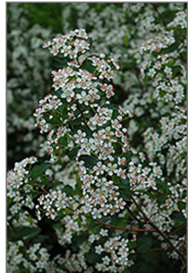
Black Chokeberry flowers