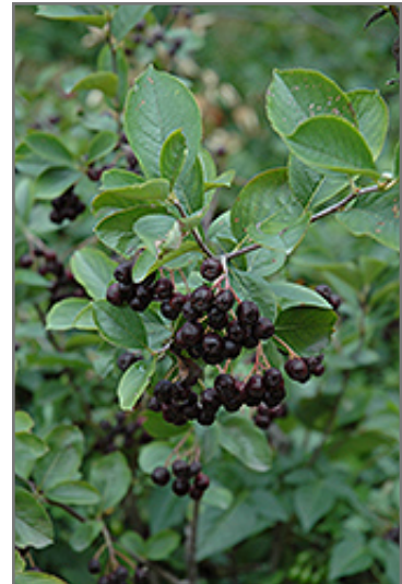
Black Chokeberry fruit