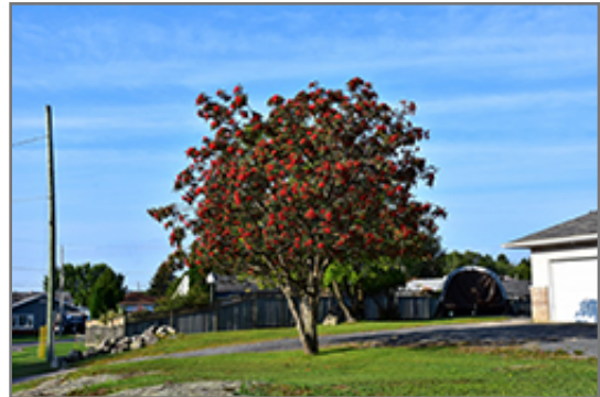
Showy Mountain Ash fruit

Showy Mountain Ash is recommended for the following landscape applications;