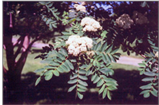
Showy Mountain Ash flowers

* This is a 'special order' plant - contact store for details