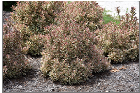
My Monet Weigela

My Monet Weigela makes a fine choice for the outdoor landscape, but it is also well-suited for use in outdoor pots and containers. It is often used as a 'filler' in the 'spiller-thriller-filler' container combination, providing a mass of flowers and foliage against which the thriller plants stand out. Note that when grown in a container, it may not perform exactly as indicated on the tag - this is to be expected. Also note that when growing plants in outdoor containers and baskets, they may require more frequent waterings than they would in the yard or garden.