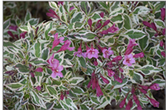
My Monet Weigela flowers

My Monet Weigela is recommended for the following landscape applications;