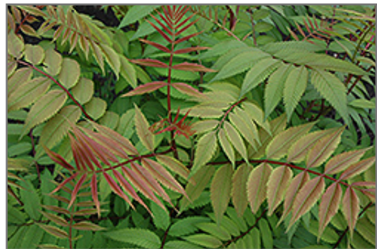
Sem False Spirea foliage

Sem False Spirea is a multi-stemmed deciduous shrub with a more or less rounded form. Its average texture blends into the landscape, but can be balanced by one or two finer or coarser trees or shrubs for an effective composition.