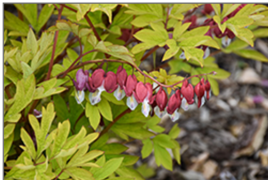
Ruby Gold Bleeding Heart flowers