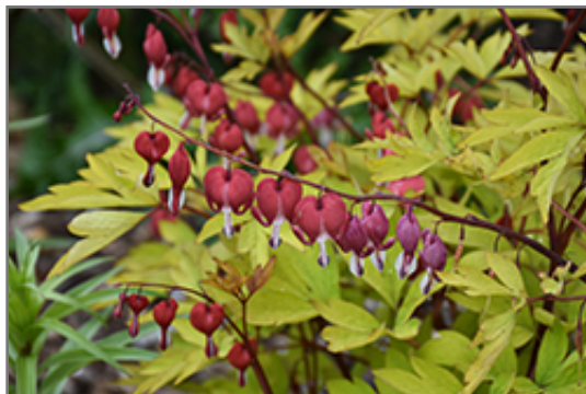
Ruby Gold Bleeding Heart flowers

This plant will require occasional maintenance and upkeep, and should be cut back in late fall in preparation for winter. It is a good choice for attracting butterflies and hummingbirds to your yard, but is not particularly attractive to deer who tend to leave it alone in favor of tastier treats. It has no significant negative characteristics.