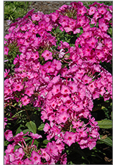
Flame Pink Garden Phlox flowers

Flame Pink Garden Phlox is recommended for the following landscape applications;