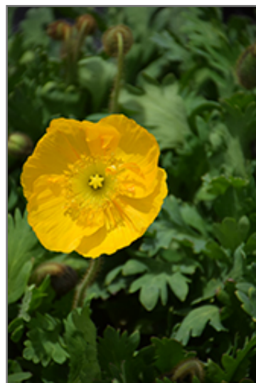
Champagne Bubbles Yellow Poppy flowers

Champagne Bubbles Yellow Poppy is an open herbaceous perennial with tall flower stalks held atop a low mound of foliage. It brings an extremely fine and delicate texture to the garden composition and should be used to full effect.