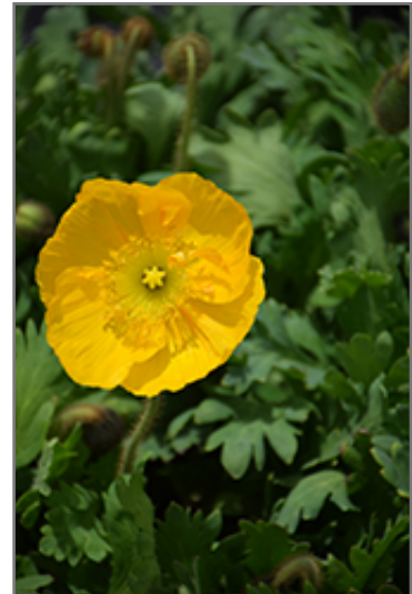
Champagne Bubbles Yellow Poppy flowers

Champagne Bubbles Yellow Poppy is an open herbaceous perennial with tall flower stalks held atop a low mound of foliage. It brings an extremely fine and delicate texture to the garden composition and should be used to full effect.