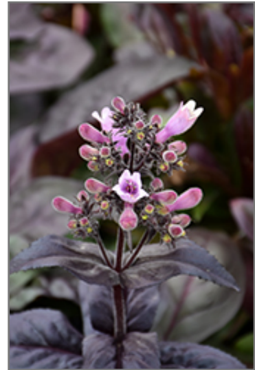
Dakota Burgundy Beard Tongue flowers

Dakota Burgundy Beard Tongue is an herbaceous perennial with an upright spreading habit of growth. Its medium texture blends into the garden, but can always be balanced by a couple of finer or coarser plants for an effective composition.