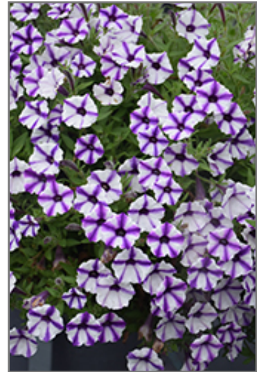
Supertunia Mini Vista Violet Star Petunia flowers

Supertunia Mini Vista Violet Star Petunia is a dense herbaceous annual with a trailing habit of growth, eventually spilling over the edges of hanging baskets and containers. Its medium texture blends into the garden, but can always be balanced by a couple of finer or coarser plants for an effective composition.