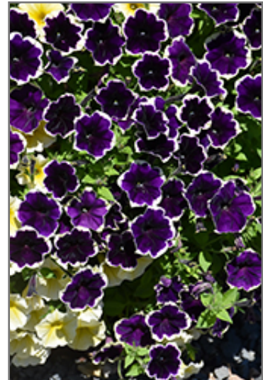
SureShot Blueberries & Cream Petunia flowers

SureShot Blueberries & Cream Petunia is a dense herbaceous annual with a trailing habit of growth, eventually spilling over the edges of hanging baskets and containers. Its medium texture blends into the garden, but can always be balanced by a couple of finer or coarser plants for an effective composition.