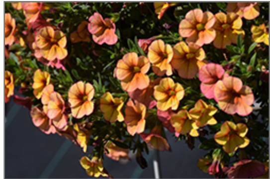
MiniFamous Uno Orange + Red Vein Calibrachoa flowers

MiniFamous Uno Orange + Red Vein Calibrachoa is a dense herbaceous annual with a trailing habit of growth, eventually spilling over the edges of hanging baskets and containers. Its medium texture blends into the garden, but can always be balanced by a couple of finer or coarser plants for an effective composition.