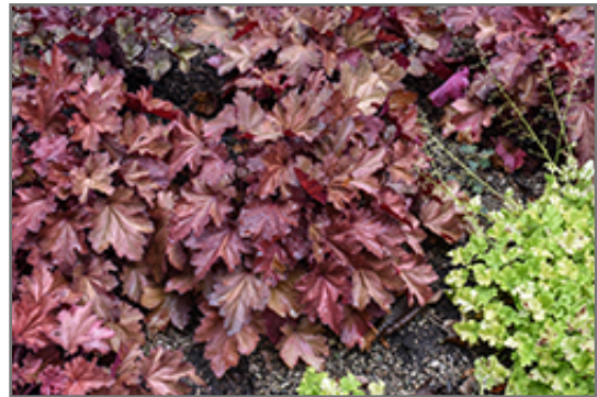
Magma Coral Bells