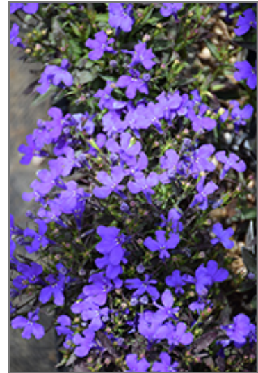
Crystal Palace Lobelia flowers

Crystal Palace Lobelia is recommended for the following landscape applications;