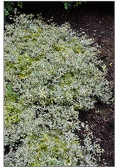
Golden Feathers Jacob's Ladder foliage

Golden Feathers Jacob's Ladder is recommended for the following landscape applications;