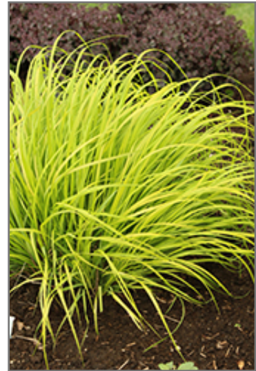
Prairie Winds Lemon Squeeze Fountain Grass

This is a relatively low maintenance plant, and is best cleaned up in early spring before it resumes active growth for the season. Deer don't particularly care for this plant and will usually leave it alone in favor of tastier treats. It has no significant negative characteristics.