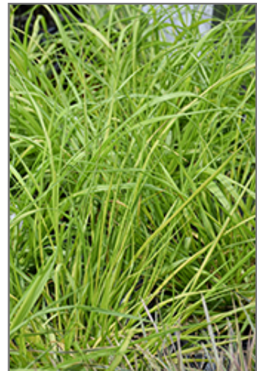
Prairie Winds Lemon Squeeze Fountain Grass foliage