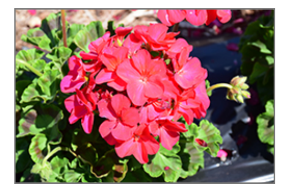
Pinto Premium Violet Geranium flowers