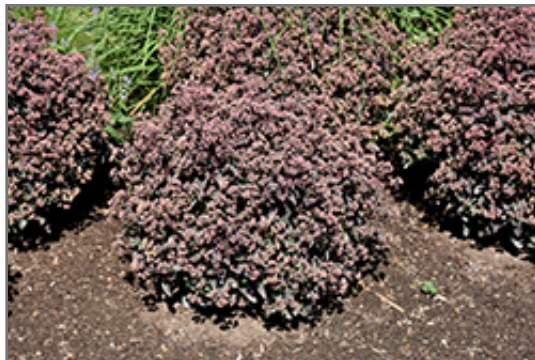
Rock 'N Grow Tiramisu Stonecrop in bloom