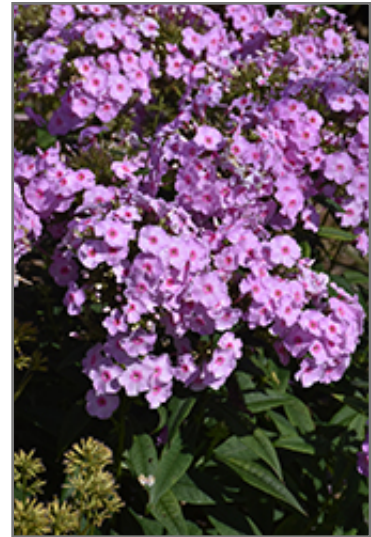
Luminary Opalescence Garden Phlox flowers

This plant will require occasional maintenance and upkeep, and should be cut back in late fall in preparation for winter. It is a good choice for attracting butterflies and hummingbirds to your yard. Gardeners should be aware of the following characteristic(s) that may warrant special consideration;