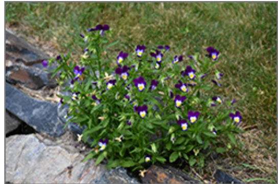
Johnny Jump-Up in bloom

Johnny Jump-Up will grow to be only 4 inches tall at maturity extending to 6 inches tall with the flowers, with a spread of 6 inches. When grown in masses or used as a bedding plant, individual plants should be spaced approximately 5 inches apart. It grows at a fast rate, and tends to be biennial, meaning that it puts on vegetative growth the first year, flowers the second, and then dies. However, this species tends to self-seed and will thereby endure for years in the garden if allowed. As an herbaceous perennial, this plant will usually die back to the crown each winter, and will regrow from the base each spring. Be careful not to disturb the crown in late winter when it may not be readily seen!