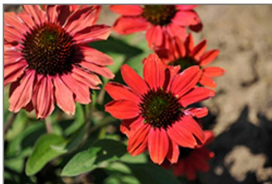
Color Coded Frankly Scarlet Coneflower flowers