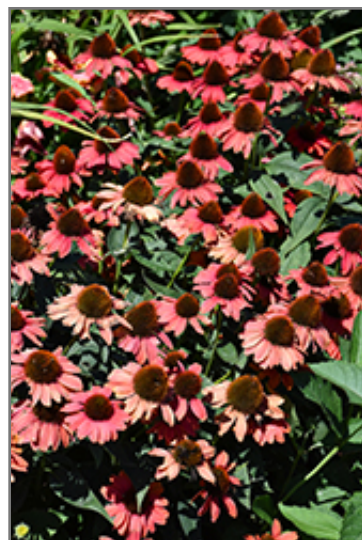
Color Coded Frankly Scarlet Coneflower flowers

Color Coded Frankly Scarlet Coneflower is an herbaceous perennial with an upright spreading habit of growth. Its medium texture blends into the garden, but can always be balanced by a couple of finer or coarser plants for an effective composition.