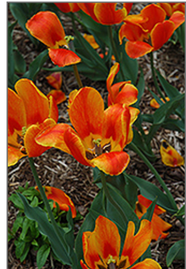
Flair Tulip flowers