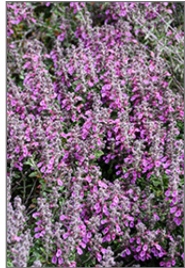
Creeping Germander flowers