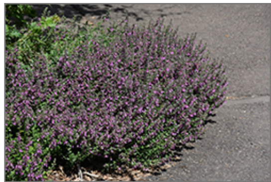
Creeping Germander in bloom