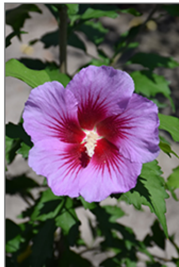
Purple Pillar Rose of Sharon flowers

This is a high maintenance shrub that will require regular care and upkeep, and is best pruned in late winter once the threat of extreme cold has passed. It is a good choice for attracting butterflies and hummingbirds to your yard, but is not particularly attractive to deer who tend to leave it alone in favor of tastier treats. Gardeners should be aware of the following characteristic(s) that may warrant special consideration;