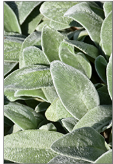
Lamb's Ears foliage