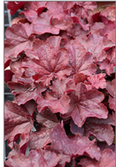
Northern Exposure Red Coral Bells foliage

Northern Exposure Red Coral Bells is recommended for the following landscape applications;