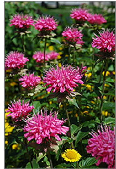
Marshall's Delight Beebalm flowers