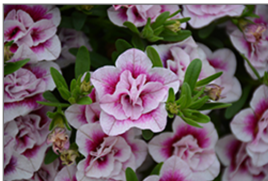
MiniFamous Uno Double PinkTastic Calibrachoa flowers

MiniFamous Uno Double PinkTastic Calibrachoa is a dense herbaceous annual with a trailing habit of growth, eventually spilling over the edges of hanging baskets and containers. Its medium texture blends into the garden, but can always be balanced by a couple of finer or coarser plants for an effective composition.