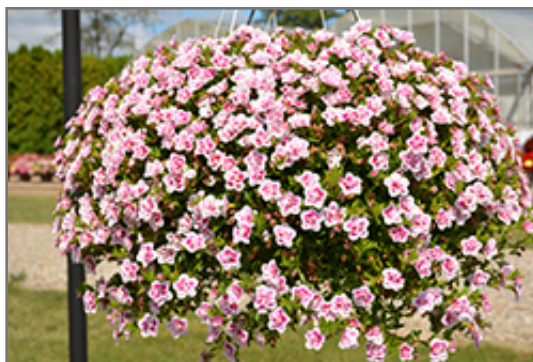
MiniFamous Uno Double PinkTastic Calibrachoa in bloom