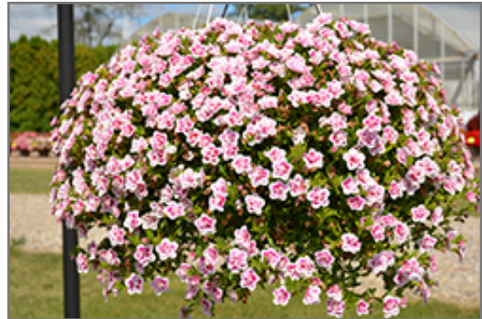
MiniFamous Uno Double PinkTastic Calibrachoa in bloom